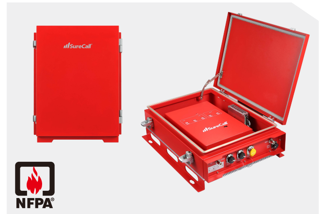
SureCall Guardian3 QR Bi-Directional Amplifier with Nema4 Rated Enclosure